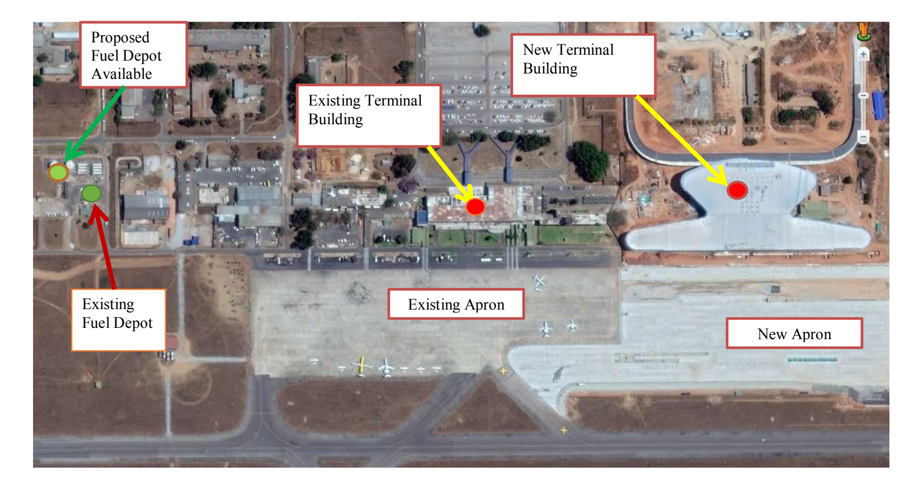
Figure 1.1 Airport General layout-Kenneth Kaunda International Airport general layout map showing locations of: existing and new Terminal Buildings, aircraft aprons, JET A1 fuel Depot facilities and proposed locations for the new fuel farm/Depot